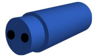
Digital Mini Mic Receiver